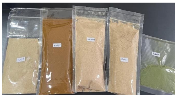
Figure 3. Ginger Powder (Left), Turmeric, Galangal, Lemongrass and Moringa Leaves (Right)

packed using ziplock plastic and sealed so that the simplicia powder is durable. The results of making powder using dehydrators on natural spices are presented in Figure 3 .