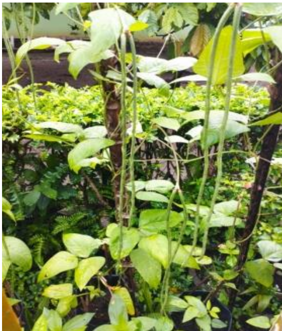
Figure 1. Long bean plants