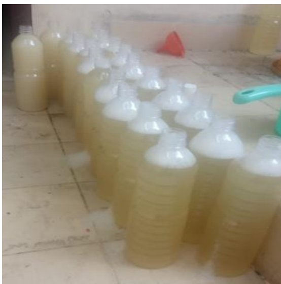
Figure 2. Liquid tofu waste

Indonesia (2022), long bean productivity increased from 2013-2018, ranging from 92,520 to 321,066 kg/ha with an average increase of 38,094 kg/ha. However, there was instability in production from 2019-2021, ranging from 293,128 to 2,640 kg/ha. In 2021, a very rapid production decline from 2020 of 420 kg/ha. It can be concluded that innovations need to be made to increase long bean production and is by community expectations. One way that can be done to achieve this goal is with fertilization and media to support growth and production yields to obtain varieties that have superior characteristics with high production.