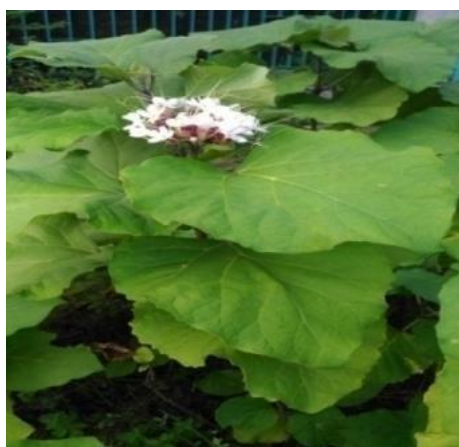
Figure 1. Sarang Banua Plants

North Sumatra (Figure 1). As a result of plant determination, the sarang banua (local name) is a type Clerodendrum fragrans Vent Willd, belongs to the Verbenaceae family (Simorangkir et al. 2019b). Simorangkir et al. (2018) reported that extract of sarang banua leaves contains secondary metabolites of alkaloids, steroids and flavonoids. The research results of Simorangkir et al. (2019a) showed that sarang banua leaf extract has high antioxidant activity. Ethanol extract and ethyl acetate extract of sarang banua leaves have very high antioxidant activity with LC 50 values of 22.37 ppm and 27.26 ppm close to the LC 50 of vitamin C (20.18 ppm) as an antioxidant standard using the radical scavenging method. DPPH free.