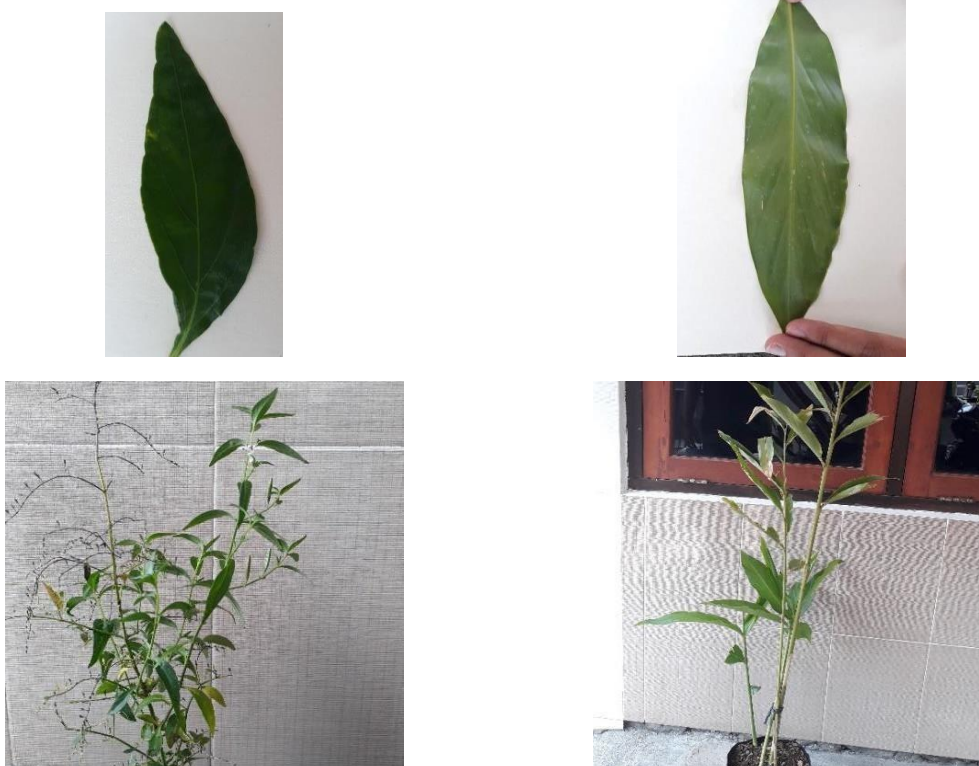
Figure 1. Sambiloto leaf, Cardamom leaf, Sambiloto and Cardamom plants

DNA isolation was carried out using the Doyle and Doyle (1987) method with slight modifications (Kamilah et al, 2022). The CTAB buffer was incubated at 65°C, the plant leaf samples were weighed as much as 0.4 g, the samples were crushed using mortar and pestel. The CTAB buffer was added in 5 mL increments. The sample was then transferred to a new microtube of 1 mL. Samples were incubated in a water bath at 65°C for 1 hour. The CIA solution was added 500 µL and vortexed for approximately 1 minute. The sample was centrifuged at 8000 rpm for 10 minutes. The supernatant layer was collected to a new microtube. Isopropanol was added as much as 500 µL. The samples were then incubated at -20°C overnight. Samples were centrifuged at 8000 rpm for 10 minutes. The pellet was air-dried until the supernatant solution was completely evaporated. The dried pellets were washed using 200 µL 70% alcohol. Alcohol was aspirated and the pellet was dried and then 50 µL of TE buffer was added.