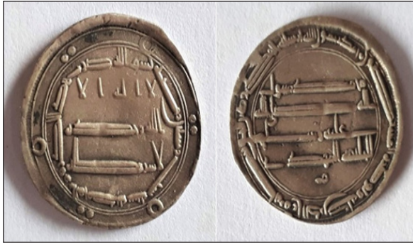
Figure 7. Dirham from Caliph Muhammad Al-Mahdi reign, date 166 A.H. (782 – 783 A.D.), obverse (left) & reverse (right)

The seventh coin is a dirham (silver coin) collection by the Sumatra Museum of money (see Figure 8 ). This museum obtained this coin from a resident of the Jagojago village, whose daily activity is mining for gold at the Bongal site. The coin has a diameter of 25.20 mm, a thickness of 0.84 mm, and a weight of 2.60 gr. Both sides of this coin were inscribed with Arabic letters in Kufic style. On the obverse side, it is read: lā ilāha illallāh waḥdahū lā sharīkalah (There is no deity but God alone, no partner for Him), while on the margin, it is read: bismillāh ḡuriba hadhā al-dirham bi madīnat al-salām sanah khams wa tīs‘īn wa mi’ah (In the name of Allah. This dirham was minted in the city of Salam in the year one hundred and ninety-five). On the reverse, it is read: Rabbī Allāh Muḡammad Rasūlullāh min-mā amara bihī ‘Abdullāh al-Amīn Muḡammad Amīr al-Mu‘minīn al-‘Abbās (Allah is My Lord.