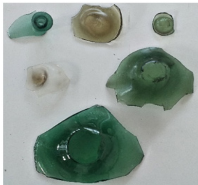
Figure 11. Glass fragments from Bongal Site

Arab merchants and sailors brought these items to the Archipelago as goods traded in the archipelago's commercial centers. The artifacts from the Middle East at the Bongal site were not impossible to be brought directly by ships from the region. The ruins discovery of Arab ships in Belitung waters (Flecker 2004, 2–39) is clear evidence that Arab sailors and traders have known the waters and places in the archipelago. Aside from being traded, these goods from the Middle East were possibly exchanged for natural commodities produced in the area around the west coast and inland of North Sumatra. Agricultural commodities referred to were camphor, incense, and various natural gums, which had high economic value in the international market then.