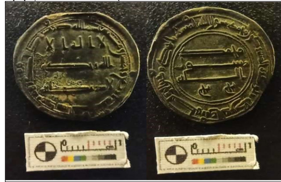
Figure 6. Dirham from Caliph Abu Ja'far Al-Mansur reign, date 154 A.H. (770–771 A.D.), obverse (left) & reverse (right)

on the margin, it is read: Muḥammad Rasūlullāh arsalahū bilhudā wa dīn-al-ḥaq li-yuḏhirahū 'ala-al-dīn kullih wa law kariha al-mushrikūn (Muhammad is the messenger of Allah. He sent him with guidance and the Religious of Truth to make it prevail over all religion, though the