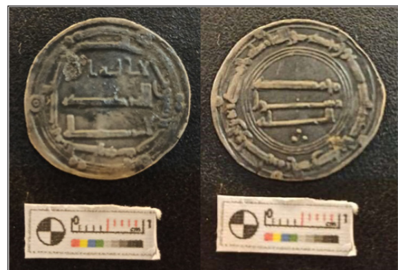
Figure 2. Dirham from Caliph Abu Ja'far Al-Mansur reign, date 143 A.H. (760–761 A.D.), obverse (left) & reverse (right)

of the Jagojago village, whose daily activity is mining for gold at the Bongal site. The coin has a diameter of 24.68 mm, a thickness of 0.76 mm, and a weight of 2.83 gr. On both sides of this coin are inscriptions in Arabic letters in Kufic style. The obverse carries the inscription: lā ilāha illallāh waḥdahū lā sharīkalah (There is no deity but God alone, no partner for Him), while on the margin, it read: bismillāh ḍuriba hadhā al-dirham bi-al-kūfah sanah thalātha wa arba'in wa mi'ah (In the name of Allah. This dirham