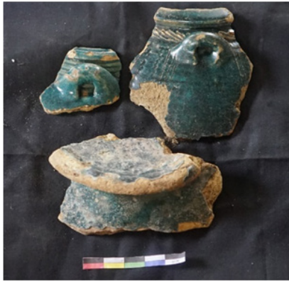
Figure 10. Glazed finepaste ware from Bongal site