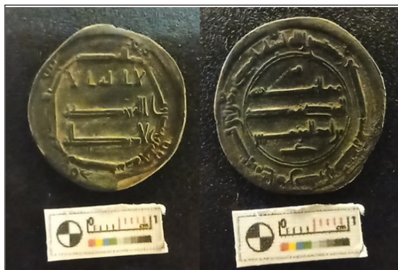
Figure 5. Dirham from Caliph Abu Ja'far Al-Mansur reign, date 149 A.H. (766–767 A.D.), obverse (left) & reverse (right)

dirham was minted in the city of Muhammadiyah in the year of one hundred and forty-nine). On the reverse side, it shows: mim min-mā amara bihī al-mahdī Muḥammad ibn Amīr al-Mu'minīn 'ain (By order of al-Mahdī Muhammad, the son of the believers' leader), while on the margin it read: Muḥammad Rasūlullāh arsalahū bilhudā wa dīn-al-ḥaq li-yuḏhirahū 'ala-al-dīn kullih wa law kariha al-mushrikūn (Muhammad is the messenger of Allah. He sent him with guidance and the Religious of Truth to make it prevail over all religion, though the idolaters are averse).