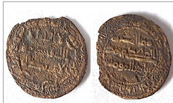
Figure 4. Dirham from Caliph Abu Ja’far Al-Mansur reign, 147 A.H. (764 – 765 A.D.), obverse (left) & reverse (right)

Jagojago Village (see Figure 4 ). The coin is 1.7 cm in diameter and inscribed with Arabic letters in Kufic style on both sides. On the obverse, it is read: lā ilāha illallāh waḥdahū lā sharīkalah (There is no deity but God alone, no partner for Him), while on the margin, it is read: bismillāh ḡuriba hadhā al-dirham bi-al-raī sanah sab‘ wa arba‘īn wa mi’ah (In the name of Allah. This dirham was minted in the city of Ray in the year of one hundred and forty-seven). The reverse shows: min-mā amara bihī al-mahdī Muḥammad ibn Amir al-Mu‘minīn (By order of al-Mahdī Muhammad, son of the believers’ leader), while on the margin, it read: Muḥammad Rasūlullāh arsalahū bilhudā wa dīn-al-ḥaq li-yuḏhirahū ‘ala-al-dīn kullih wa law kariha al-mushrikūn (Muhammad is the messenger of Allah. He sent him with guidance and the Religious of Truth to make it prevail over all religion, though the idolaters are averse).