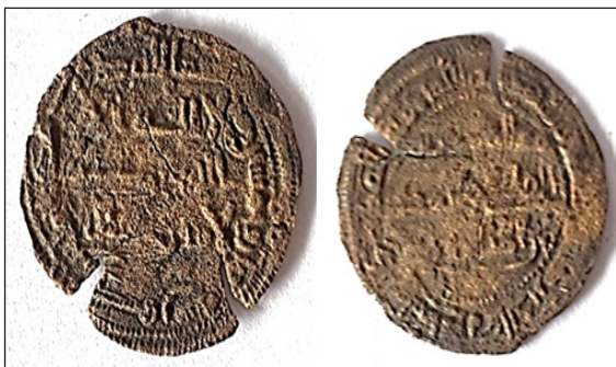
Figure 3. Dirham from Caliph Abu Ja’far Al-Mansur reign, 147 A.H. (764–765 A.D.), obverse (left) & reverse (right)