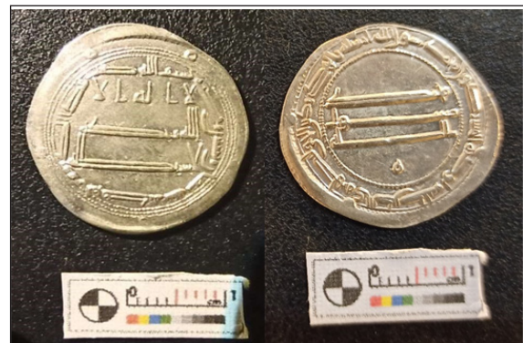
Figure 9. Dirham from Caliph Al-Ma'mun reign, date 204 A.H (819 – 820 A.D.), obverse (left) & reverse (right)

The eighth coin is a dirham (silver coin) collection by the Sumatra Museum of Money (see Figure 9 ). This museum obtained this coin from a resident of the Jagojago village, whose daily activity is mining for gold at the Bongal site. The coin has a diameter of 23.16 mm, a thickness of 0.96 mm, and a weight of 2.84 gr. Both sides of the coin are inscribed with Arabic letters in Kufic style. On the obverse side, it is read: lā ilāha illallāh waḥdahū lā sharīkalah (There is no deity but God alone, no partner for Him), while on the margin, it read: bismillāh ḡuriba hadhā al-dirham bi-al- Muḡammadiyyah sanah arba‘ wa mi’ah (In the name of Allah. This dirham was minted in the city of Muhammadiyyah in the year of one hundred and four). On the reverse, it is read: Muḡammad Rasūlullāh al-khalīfah al-Ma’mūn (Muhammad is the messenger of Allah. Caliph al-Ma’mūn. It followed letter ha ), while on the margin, it is read: Muḡammad Rasūlullāh arsalahū bilhudā wa dīn-al-ḡaq li-yuḡhīrahū ‘ala-al-dīn kullih wa law kariha al-mushrikūn (Muhammad is the messenger of Allah. He sent him with guidance and the Religious of Truth