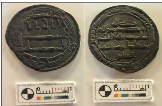
Figure 8. Dirham from Caliph Muhammad Al-Amin reign, date 195 A.H. (810–811 A.D.), obverse (left) & reverse (right)

The seventh coin is a dirham (silver coin) collection by the Sumatra Museum of money (see Figure 8 ). This museum obtained this coin from a resident of the Jagojago village, whose daily activity is mining for gold at the Bongal site. The coin has a diameter of 25.20 mm, a thickness of 0.84 mm, and a weight of 2.60 gr. Both sides of this coin were inscribed with Arabic letters in Kufic style. On the obverse side, it is read: lā ilāha illallāh waḥdahū lā sharīkalah (There is no deity but God alone, no partner for Him), while on the margin, it is read: bismillāh ḡuriba hadhā al-dirham bi madīnat al-salām sanah khams wa tīs‘īn wa mi’ah (In the name of Allah. This dirham was minted in the city of Salam in the year one hundred and ninety-five). On the reverse, it is read: Rabbī Allāh Muḡammad Rasūlullāh min-mā amara bihī ‘Abdullāh al-Amīn Muḡammad Amīr al-Mu‘minīn al-‘Abbās (Allah is My Lord.