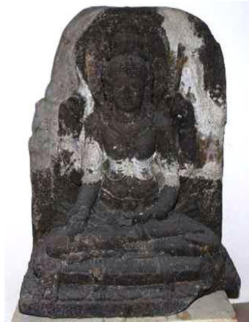
Picture 2. The Goddess Śrī Vasudhara.

Soekarto Atmodjo dated it to c. 600 AD and identified a possible reference to the Yamuna River (Nitihaminoto et al. 1978: 19). The inscription of Balekambang was recently studied by A. Griffiths (2012: 474-477), who, based on a paleographic comparison with the inscription of Kalasan, would place the writing of the Balekambang inscription in the second half of the seventh Century. The same author proposes a transcription and translation, that we reproduce here: ‘May this life (on earth) be long for this