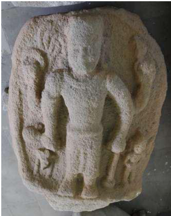
Picture 4. Viṣṇu/Harihara statue from Pejaten.