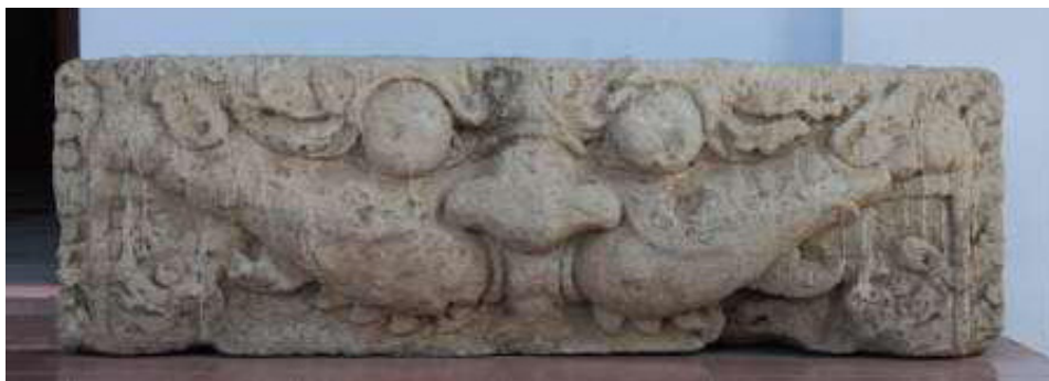
Picture 6. Fragment of Kāla from Cepit (Source: Doc. of Pusarnas and EFEO).

Today, the statues are no longer in situ and we must therefore base ourselves on the observations made in the 1970’s to get an idea of the nature of the site. The presence of large rectangular stones (probably parts of a door frame) and of a lintel is a sufficient evidence to conclude to the former existence of a temple. In the light of the yoni , lingga, bull, and Gaṇeśa, we can also safely say that it was a Hindu monument. The lintel mentioned by Satari, which also appears on the photos of the 1978 excavations,