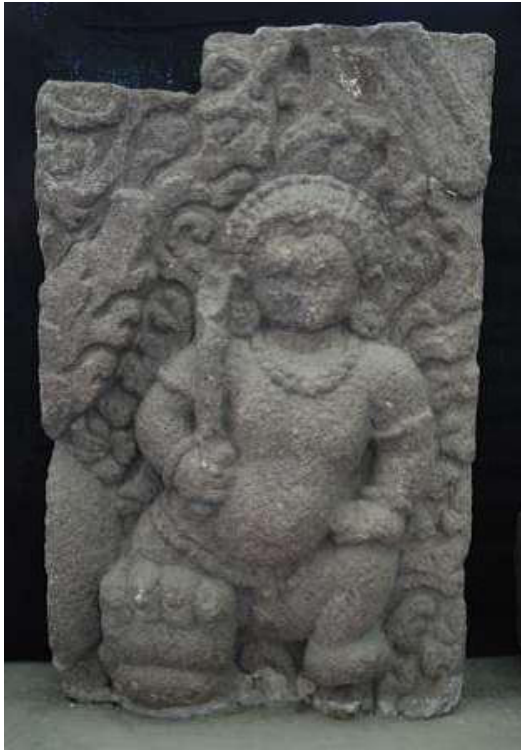
Picture 6. A part of Kāla from Deles Site.

best statues of the Yogyakarta area. The bull's position is very naturalistic and his eyes expressed great gentleness. The last bull - which is also the one who is most likely to come from Cepit and not from Deles - is particularly noteworthy because of the inscription that it bears on the base. This brief text has been studied by Griffiths (2012: 473-474). He gives the following reading, "namaś śivāya janmaccheda [kāraṇāya]" (homage to Śiva, Cause of the cessation of rebirth) and dates it on paleographical grounds to the seventh or eighth Century.