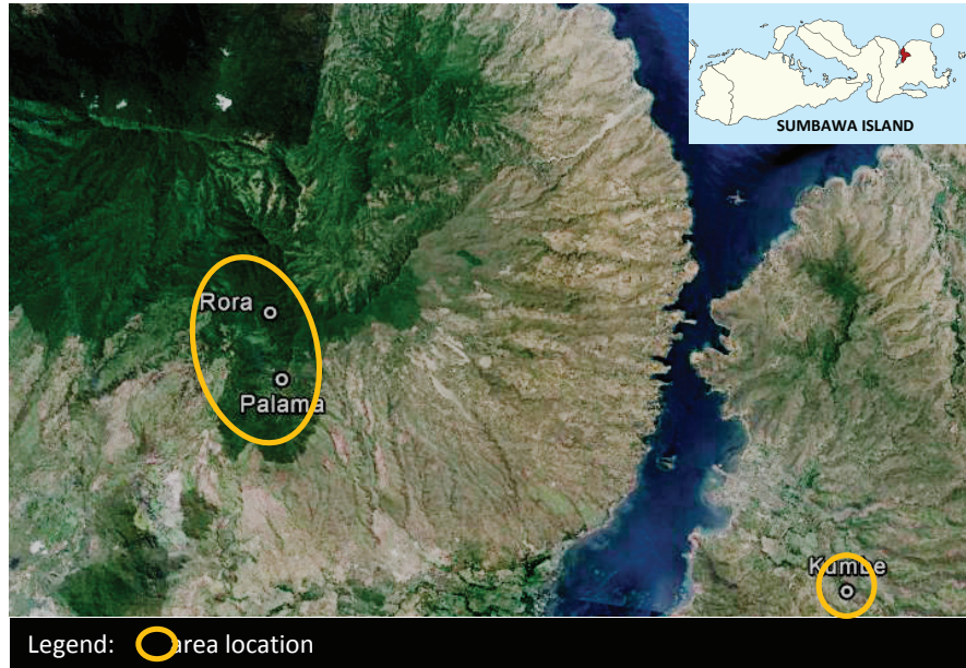
Map 2. Distribution area of stone jars in Bima (from google map)

into two types consist of cover and lid form. Cover of stone jars has three main types; instead of it the lid has two main types.