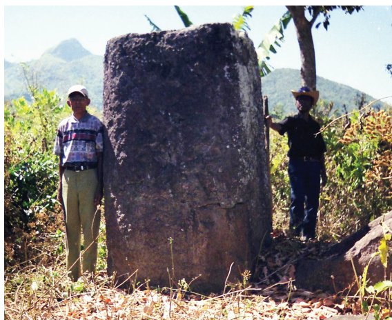
Figure 1. Cover of stone jar subtype B1 at Doro Ndano Belanda Site

Type B illustrated by cylindrical longitudinal section, having roof in dome/cap form without ornament on the top. While down side part is curving and form such a stair with gradual reduction in diameter upward. This type was found in Kadanga Mandada Site.