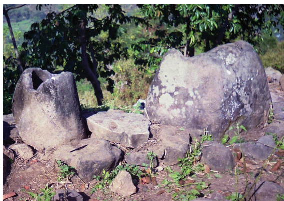
Figure 2. Cover of stone jar subtype C2 (left side) and variant A1a (right side) at Doro Kumbe

Based on that classification, we can note that stone jar with cylindrical and upward conical form is the most popular in Bima region and especially in Donggo District. The engraved motif on this stone vat is not quite various. Besides notch on mouth or vertical block carving there are no other applied ornaments. This fact has been differing Bima's stone jar from those found in Toba Lake or Central Sulawesi where many variation of ornament is prominent.