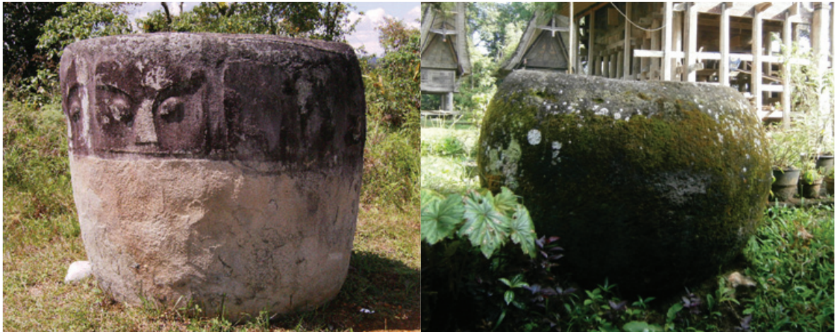
Figure 3. Stone jar from Pokekea Site (Besoa Valley, Central Sulawesi) with mask decorative pattern (left side). Stone jar from Buntu Pune Site (Toraja, South Sulawesi) (right side)

result in fine product because this raw material contains many small to large size gravels. On the contrary, andesitic raw material needs some tough workers and instruments in its treatment. It is notified that an instruments used during those days have involved metal materials in small to large chisel form. Some stone vat indicates some traces of scratch about 2 to 3 cm in size. Such vat cap that has been found in Kadanga Mandada or Madepinga sites surely needs persevering on its treatment because its rather complicated work in forming such notches/incisions.