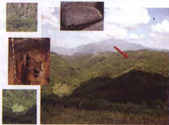
Figure 2. Location of Lolo Gedang Site (sector I and II) on Meluang hill

The site of Lolo Gedang is one of the evidences of human activities in the past, namely ceremonial activity (Sector I), which is shown by decorated cylindrical stones, and burial activity which is shown by the burial jars. This complex is located on the Meluang Hill, near Palik River that flows on its eastern part (Fig. 2).