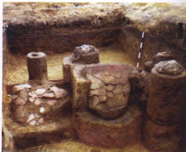
Figure 1. The complexity among the jars and potsherds at Lolo Gedang Site, Kerinci, Jambi

The shapes and sizes of the jars vary, which are the basic shapes of round and cylindrical. Some of them were decorated with irregular net-impressed motifs (interwoven patterned). They are mostly red-slipped on both the outer and inner surfaces. There are about 22 codes of burial jars from systematic excavations and another 7 obtained from illegal digging. Therefore it is assumed that there are about 29 burial jars at the Lolo Gedang Site/Sector II (Fig. 1).