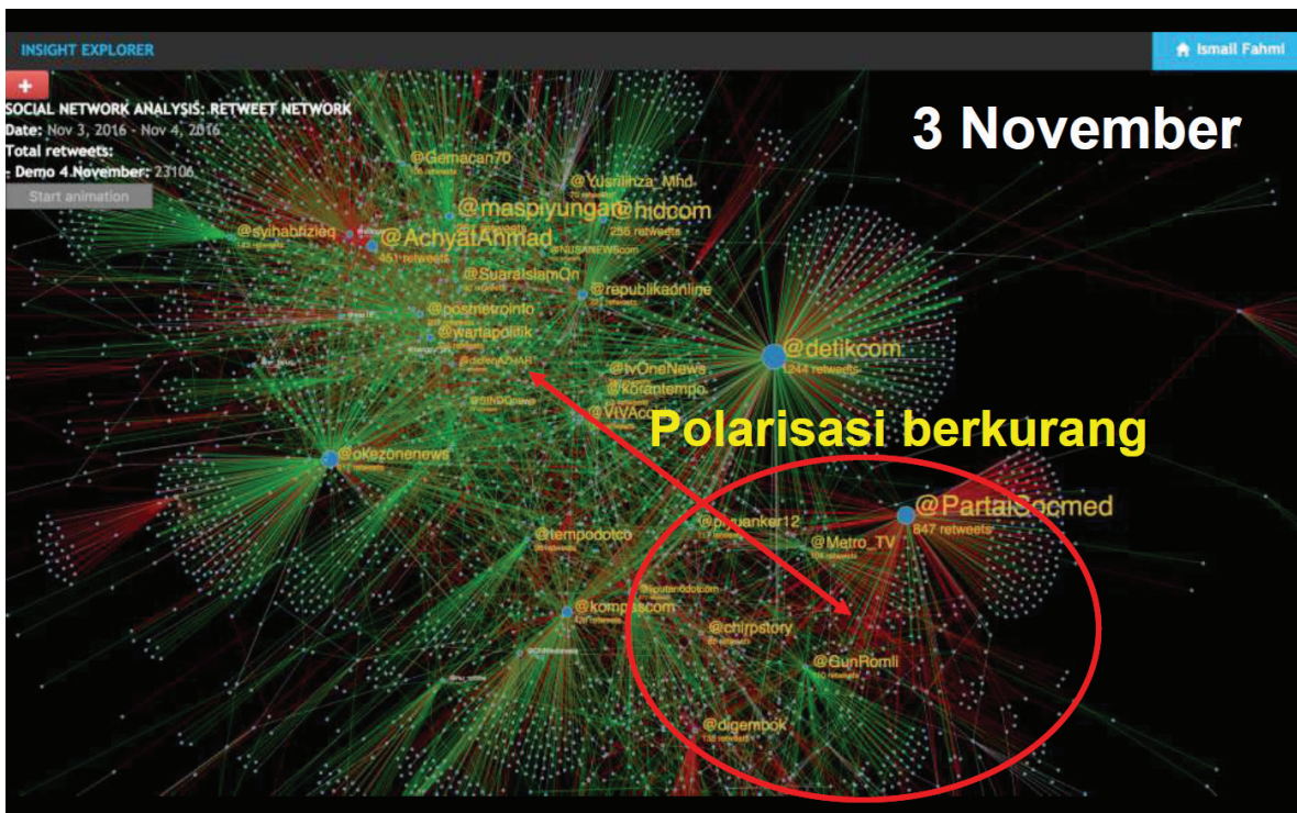
Picture 2 Drone Emprit's Social Network Analysis (November 3-4, 2016)