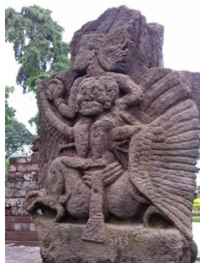
Figure 4. Relief Figure Riding a Garuda