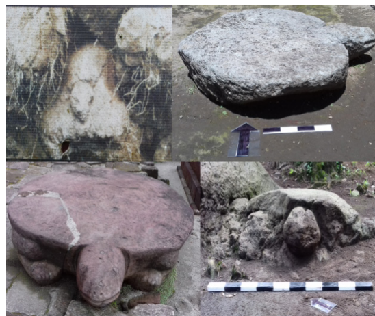
Figure 2. Tortoise statues in the Kethek, Cetho, Suku, and Cemoro Bulus Temples

The tortoise statue in Suku Temple is made in quite large size. Three-dimensional statues of number of three are located on terrace III in front of the main building in the form of trapezoid. In addition to intact statues, turtles are also carved as reliefs, namely the northern stage on one of the poles. Tortoise