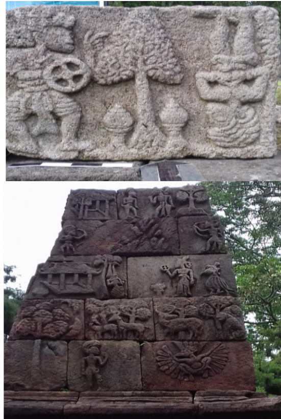
Figure 7. Figure relief takes cakra

not very clear. The other figure is carved upside down. Both hands are brought together in front of the chest. Wearing only half the body cloth, it appears only up to the knees. Headdress like an ascetic turban. Seeing the attitude of his hand and turban, most likely this figure depicts a priest ( rsi ). Between the two figures there is a kalpataru tree with two buds below.