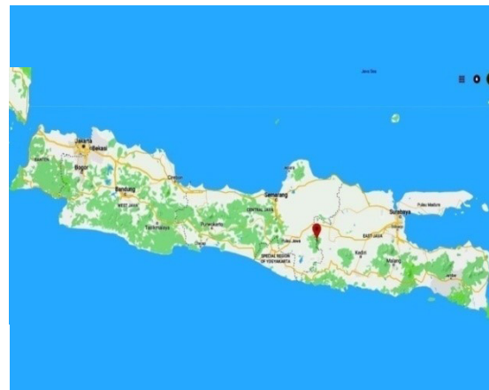
Figure 1. Research site on Mount Lawu on red dot

Karanganyar, Sragen and Wonogiri Regencies, while the eastern slope located in East Java Province, covering Ngawi and Magetan Regencies. This mountain extends from north to south, separated by the highway connecting Central Java and East Java Provinces. The northern topography is cone-shaped with the peak of Argo Dumilah as high as 3,265 meters above sea level, while the southern part is very complex consisting of steep hills, with a peak of Jobolarangan as high as 2,298 meters above sea level (Setyawan and Sugiyarto 2001, 115). The sites which are the objects of this research are all located in Karanganyar Regency.