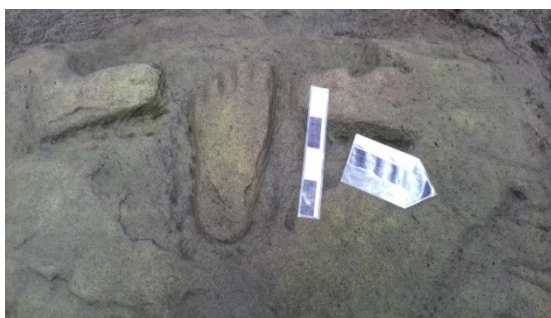
Figure 6. Foot-prints on the Cemoro Bulus Site

Another sign or symbol of Vishnu is the relief of the figure carrying the cakra . As usual in a sacred building, to distinguish the statues of the gods, we can observe the special features of the iconography. Cakra is the main weapon of Vishnu, for that reason, the relief that carries a large cakra is possible to depict the character of Vishnu. This relief is found in Cetho and Sukuh Temples. In the Cetho Temple the relief is located on Terrace VIII along with 15 other relief panels. It is carved in a square stone which has a height of 30 cm, a length of 45 cm, and a thickness of 15 cm. There are two figures depicted. The figure standing does not turn upside down with his right hand carrying the cakra , his left hand pointing forward. The attitude of the feet is faced right and left (uphill). Wearing cloth from the body to the knees. The rest of the cloth is left in the middle along the calf. Visible right hand is wearing a shoulder bracelet. The right ear appears to be wearing earrings. The decoration of the necklace is a bit vague. His hair wears a kind of crown, but it's