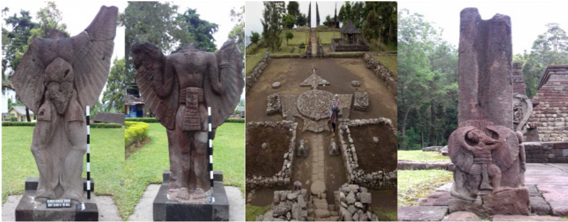
Figure 3. Garuda Statues and Relief at Cetho and Suku Temple

smoke overflowed in the sky 1364 S (1442 AD) (Rahayu 2016, 27-28). The description gives instructions about a hermit named Sagara, who apparently was carrying out a ceremony by lighting incense. Maybe this ceremony was intended for God Vishnu. In a storage of statues called Rumah Arca , located 100 meters from Suku Temple, there is the head of the Garuda statue. According to interview with the custodian of Suku Temple, it is likely that the head of this statue is the head of Garuda in the Suku Temple, but the statue of Garuda has not been confirmed yet (Interview from Gunawan, 2017). Meanwhile, Garuda reliefs were found on the gate of Paduraksa Terrace I and Terrace III on the northern obelisk.