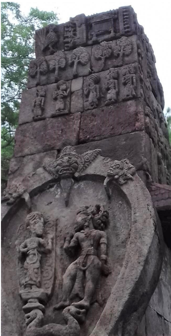
Figure 5. Vishnu resides

Garudeya's story which is still related to Vishnu is also found in the reliefs carved on the curly, the place is still in the northern obelisk. There are three sections, the lower room depicts five figures who are standing. The upper room represents five kalpataru trees. The topmost room represents a house with a gate open. Equipped with a variety of weapons, the most visible is the cakra . Garuda bird is seen in front of the gate. According to Suprpta, Cahyono, and Lutfi (1998, 67) this relief depicts the scene of the eagle when requesting amerta which is kept very secret by Vishnu at his place of residence (Figure 5).