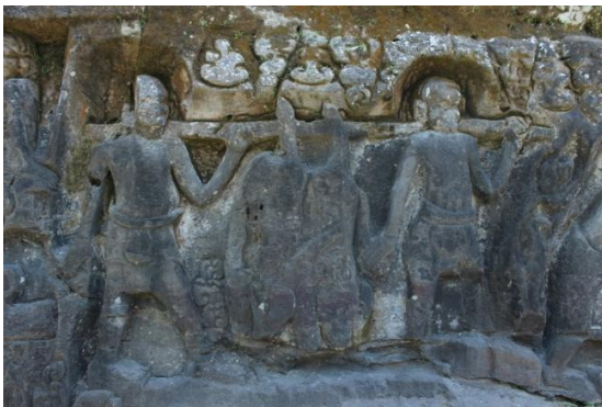
Figure 7. Scene VII

The scene depicts the scene of two male characters carrying their prey (see figure 7). The two animals with their legs hung (tied) on a wooden stick. They are carved in the same style, namely the left shoulders bear the wood, the left hands hold the wood, and the right hands of the male character in front touches the animal behind him. The two figures are both shirtless, wearing a cloth up to their thighs, and wearing an udarabandha (belt). This type of animal can be identified as a pig (Astawa 2000: 74; Adnyana 2018: 27).