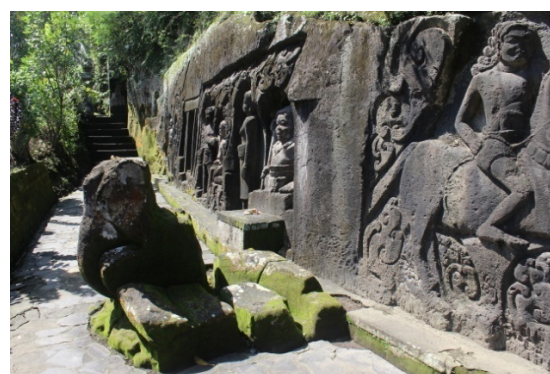
Figure 2. Yeh Pulu Site

The Yeh Pulu Relief is carved on a cliff about 25 meters in length, average height of around 2 meters, and 50 centimeters in depth. The relief can be categorized as a story relief which can be divided into nine scenes. The nine scenes of Yeh Pulu Relief are briefly described as follows.