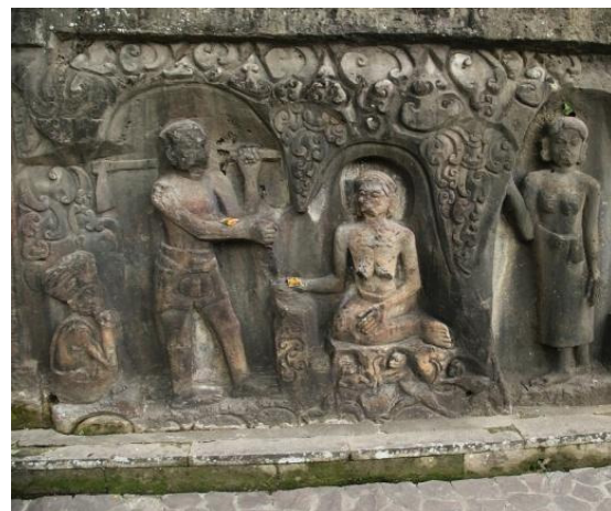
Figure 4. Scene IV

This scene depicts four successive figures from the north to the south, namely a sitting figure, a standing male character, a kneeling female figure, and a standing woman (see figure 4). The figure sitting cross-legged is depicted facing sideways towards the standing