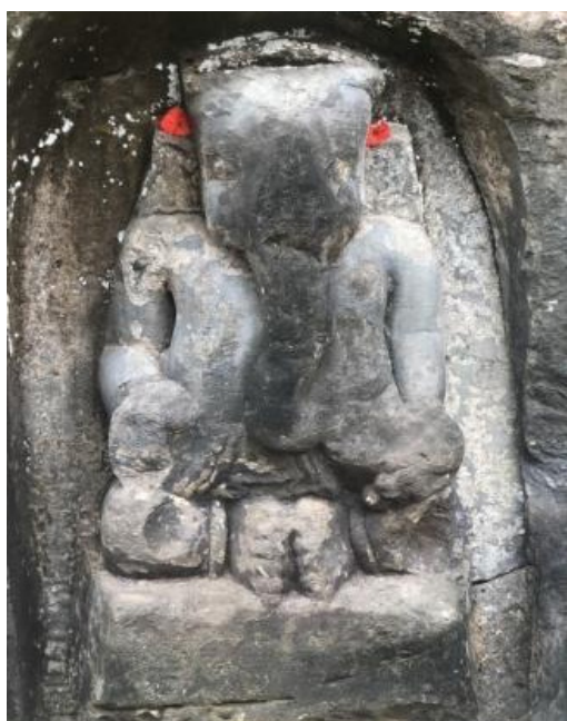
Figure 9. Scene IX

The next activity shows a male character riding a horse followed by two male figures hunting a tiger. On the next relief, it is shown that the hunted animal is a pig, which is carried by two male figures. You can see a female character holding a ponytail that is ridden by a male character with curly hair. The entire scene ends with one of the god figures, namely, Ganesha. Furthermore, according to Adnyana, Remawa, dan Diana Sari (2018: 251) there are at least two places in the setting depicted in the Yeh Pulu Relief, namely in the yard of the house and outside the house (outdoors). Activities that show the background of the place on the yard are scenes I to scene V, while the places that show the background of those places are scenes VI to IX. Astawa (2000: 75) mentioned something different, that the setting of the various activities was in the forest where a house had been built.