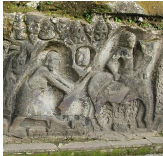
Figure 8. Scene VIII

cloth worn below the knee, and the ears are decorated with kunḍala (earrings). The male character is depicted with his left hand holding bridle, his right hand holding a weapon, naked chest, and a cloth worn above the knee. His hair is curly flowing just as it is with the head turned back.