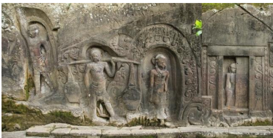
Figure 3. Scene I, II, and III

This scene shows two standing figures and each of them is depicted in a niche (see figure 3). The character located in the north is certainly male, while the southern one is female. The male character is carrying pole ( pikulan ) with two vessels at a stick (bamboo). The left hand holds the wood (bamboo) used to carry the two vessels, while the right hand holds the cloth. The two vessels seemed to be tied in such a way so as not to fall. Most likely, the contents of the vessels are tuak (a traditional Balinese drink produced from palm, coconut, or palm trees (Adnyana 2018: 26). The only jewelry used is the kunḍala (earrings) in the shape of a crescent moon, while the cloth worn reaches above the knee. The cloth is worn in a folded manner and using plain, unadorned udarabandha (a type of belt). The female character is depicted with great clothes and jewelry, in contrast to the depiction of other characters. It is likely that the character is someone of higher status and position. The head is decorated with a crown which has partially collapsed, so it cannot be ascertained its true shape. On the right and left, to be precise above the ears, there are flower decorations in