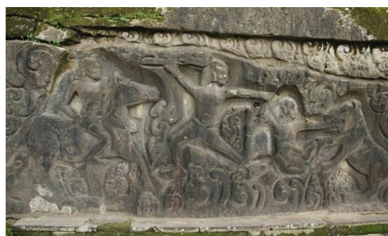
Figure 6. Scene VI

The first character inscribed in this scene is a man riding a horse (see figure 6). His left hand holds a horse rope, while the right hand holds a weapon (a type of knife). This figure is depicted with long curly hair that is left unbound, bare chest, and the length of the cloth that he wears is as long as the thigh. After that, two men are depicted fighting an animal. One of the male characters appears to be throwing a spear at the animal with their legs apart (right leg bent and left leg is straightened). His right hand holds