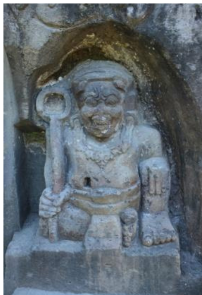
Figure 5. Scene V

stick is round with a hole in the middle (like a bowl). The left hand is placed on the leg. The head wears a folded cloth, the ears wear a kunḍala (earrings), and a hara (necklace) has a triangular-shaped leaf tendril.