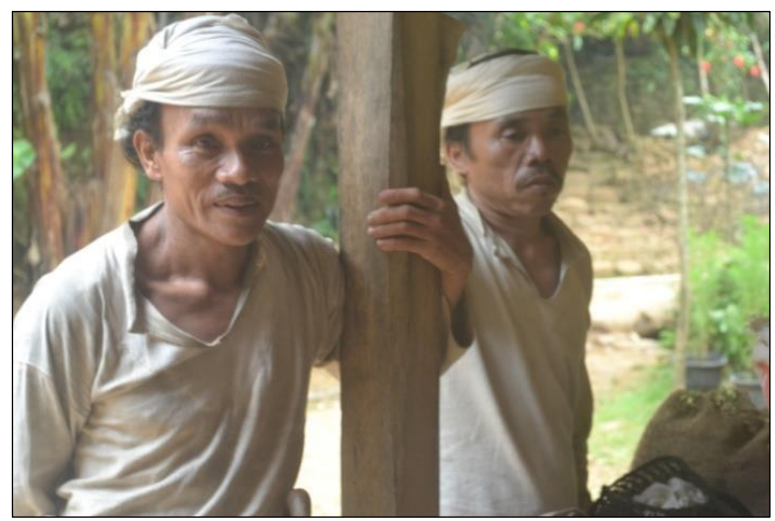
Figure 7. Baduy Dalam people wearing typical clothes of the white headband and white shirt