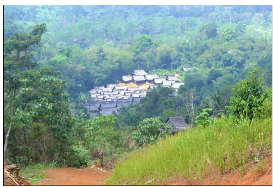
Figure 5. The settlement of the Baduy Dalam community in Cikeusik captured from afar