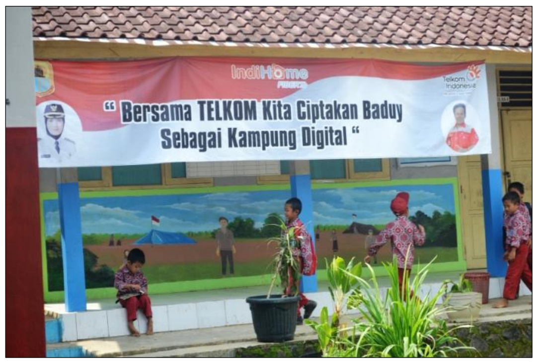
Figure 2. Information technology affects the lives of Baduy people

used for one study test. There was what was known as Heinz's dilemma among these dilemma stories. Based on the research, Kohlberg (1995) made general structures and forms of moral thought that could be defined individually regardless of the specific content of individual moral action decisions. The structure contained three different levels of moral thought, and each of these levels was divided into two interrelated stages.