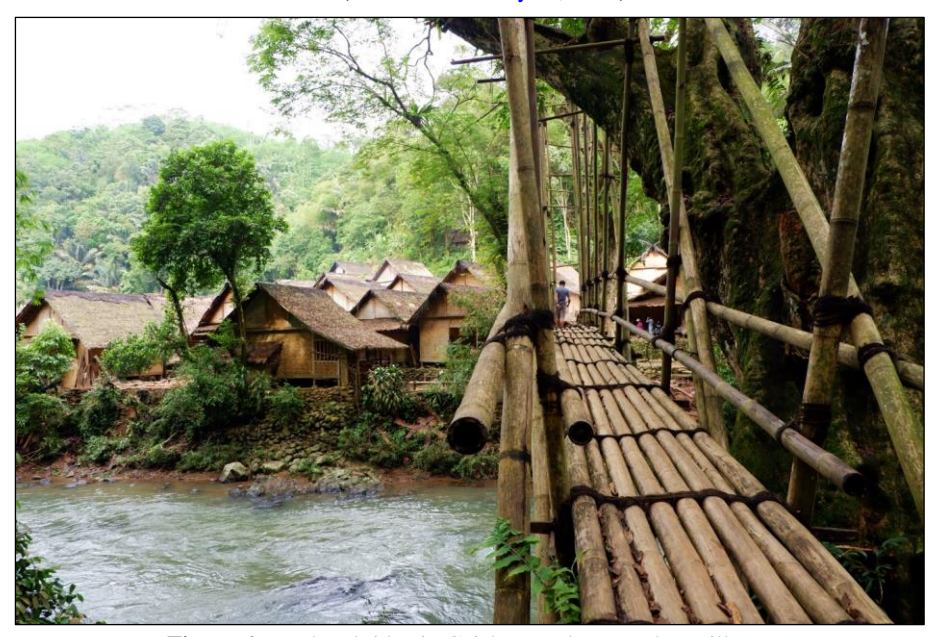
Figure 6. Bamboo bridge in Gajebo Hamlet, Kanekes Village

The appreciation of karuhun teachings resulted in the classification of the Baduy community into Baduy Dalam and Baduy Luar. Baduy Dalam Community is a community group that firmly carries out the karuhun teachings that can be seen as the core of the Baduy community. In contrast, the outside is Baduy Luar, a group of Baduy people who lack the appreciation of the karuhun teachings. The division of the community into Baduy Dalam and Baduy Luar illustrates the moral dilemma faced by Baduy people in addressing the values of modern culture. The Baduy Luar indigenous community is more open with the influence of modern culture but with an attitude to maintain customs and traditions. What distinguishes them is that what is morally right for the Baduy Luar community is lacking or not good for the Baduy Dalam community.