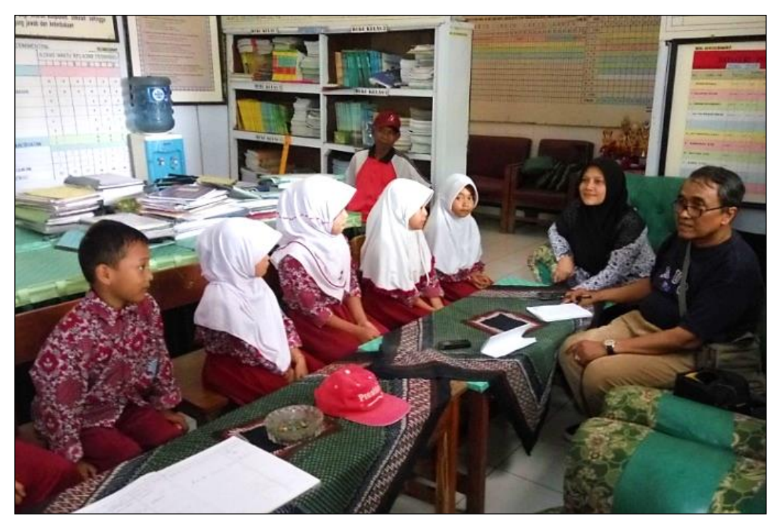
Figure 1. Children from Baduy Luar who attend SDN 02 Bojongmenteng, Ciboleger, Leuwidamar, Lebak, Banten