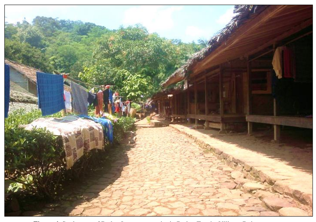
Figure 4. Settlement of Baduy Luar community in Baduy Tourist Village, Bojongmeteng

Research conducted by Sucipto & Limbeng (2007) reveals that the teachings of the Baduy community are known as pikukuh sapuluh , namely rules and ways or guidelines for how humans must behave or what should be done so as not to violate the teachings of karuhun (ancestors). Among those teachings was a prohibition to destroy others (living things, including animals) against stealing, breach promises, lying, or cheating (Sucipto & Limbeng, 2007). The karuhun teachings in the Baduy community can be seen as purified beliefs or values or in the cultural paradigm perspective of the Durkheimian community. It is called appreciation of the sacred, which is a broad sense, can be translated into morality or religion. The sacred can be an ideology or utopia of society (Supriyono, 2005).