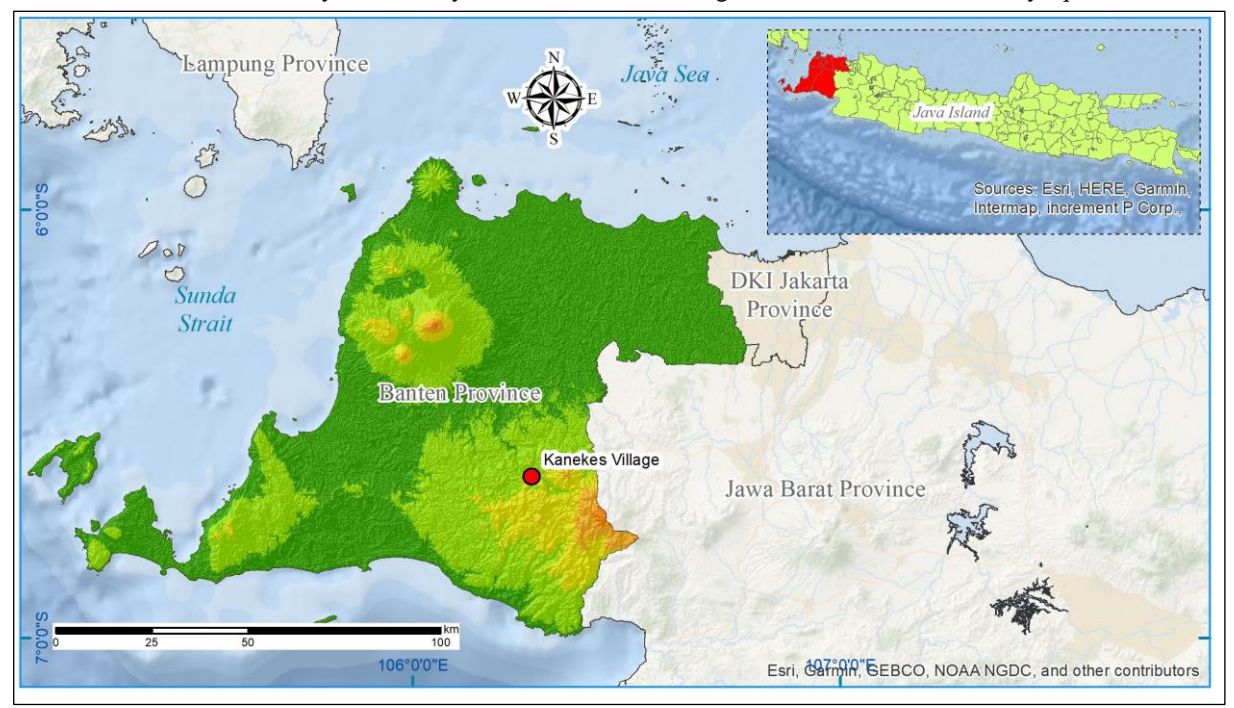
Figure 3. The location of the research in Kanekes Village, Leuwidamar, Lebak, Banten Province was shown in red pin

The theoretical foundation used to explain the actions of Baduy people in education was a theory of moral consciousness development by Kohlberg (1995). This research used the three stages of Lawrence Kohlberg's (1995) moral awareness to map the moral considerations of Baduy community leaders on their attitudes towards education. In the study conducted by Kohlberg (1995), the subjects were boys aged 10-16 years old, and they were given dilemma-themed story questions. In the