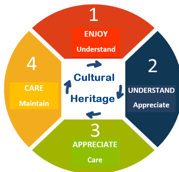
Figure 3. Cultural Heritage Attraction Management Cycle

Tourism in Indonesia has developed. Tourism positioned as the ultimate goal in increasing economic development, which has an impact on various exploitative activities to the attractiveness of natural and cultural resources that are full of economic values. In practice, tourism has deviated into production-consumption-distribution activities in which the purpose is more on the profit, not on the principle of sustainability based on scarcity ( Gunn, 1980: 8-10 ). Tourism development has forgotten the human element and its environment as a central variable in industrial design. As a result, when tourism involves cultural resources,