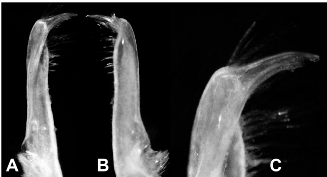
Figure 3. Parasesarma raouli Rahayu and Ng, 2009, right G1. A, B, entire length of right G1. C, tip of right G1.