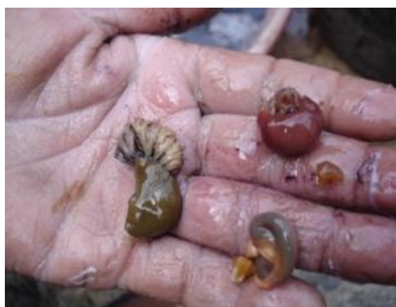
Figure 3 Eggs of wedge sea hare, Cordova, 2005