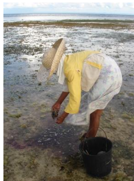
Figure 5 Gleaning Wedge Sea Hares, Cordova, 2005

confirmation of the burrows in the sand is easy, and if visibility conditions permit, gleaning is straightforward for the skilled. The author could not identify all the hares even after the burrows were pointed out many times. Local people say mata-mata ( mata means “eyes” in the Philippine dialects) is necessary to see into the burrow hole, referring to the skill and ability of sharp vision (Kumakura 1998).